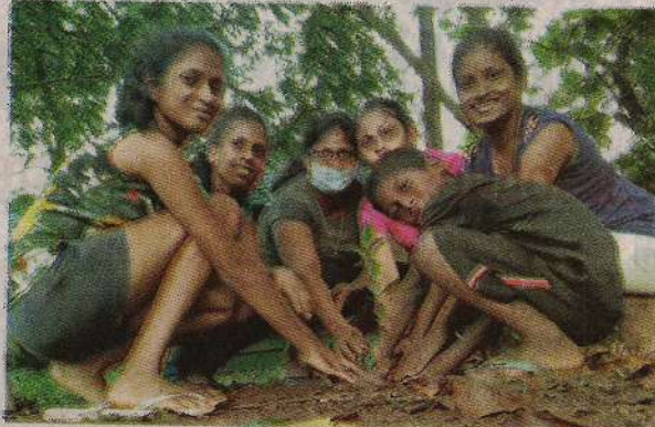
A group of youth take part in the plantation drive at Chicalim.